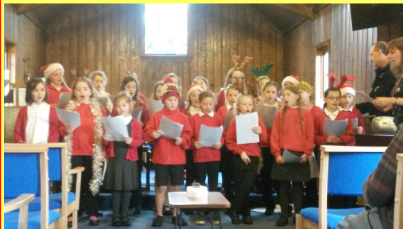
Pensilva School Choir performing Thursday 15th Dec

Once again, our school choir brought festive joy with their beautiful voices as they sang a selection of Christmas Carols. We look forward to what they will bring next year.