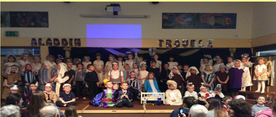
EYFS & KS1

On behalf of the governing body, best wishes for a wonderful Christmas holiday. We look forward to welcoming you back for the Spring term of 2016/17 on Tuesday 3 rd of January.